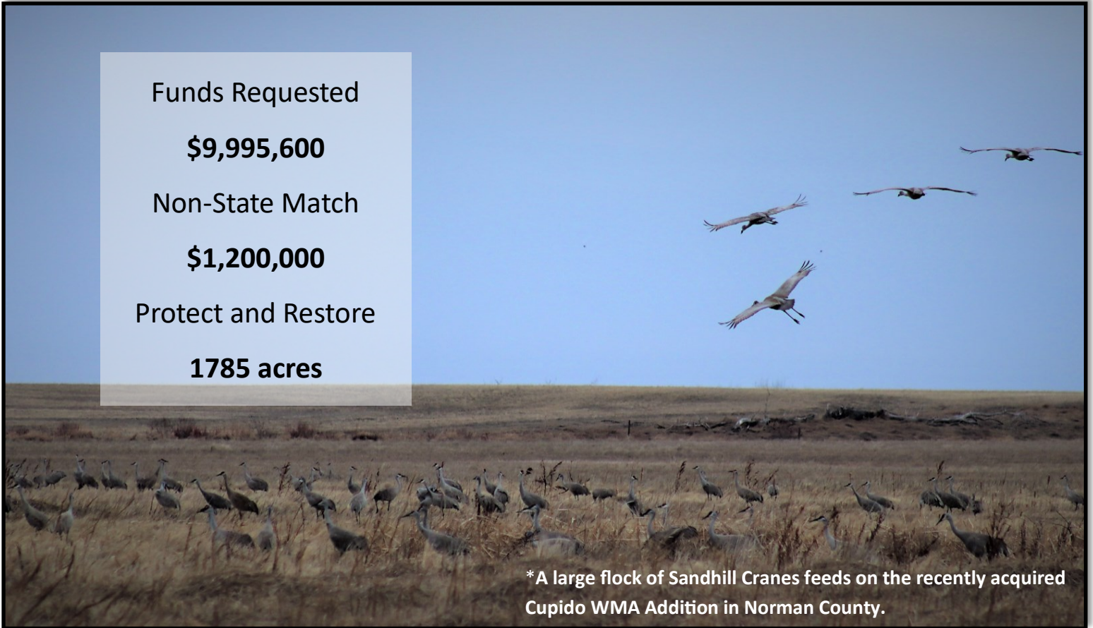
*A large flock of Sandhill Cranes feeds on the recently acquired Cupido WMA Addition in Norman County.